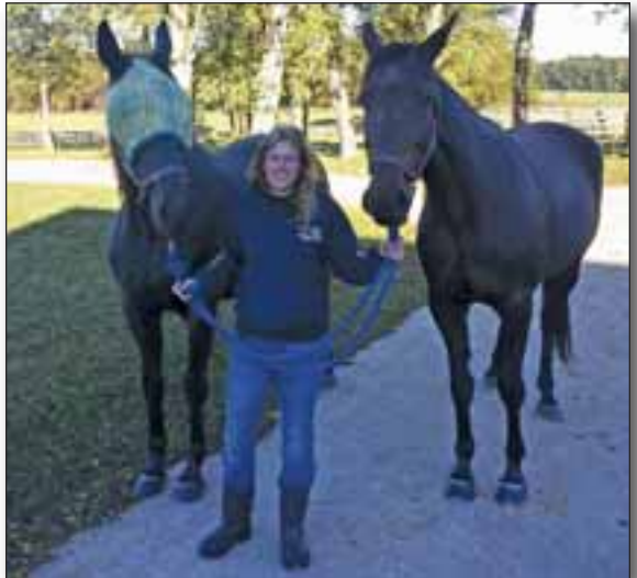
In Pennsylvania with Continentalvictory (in fly mask) and See You At Peelers