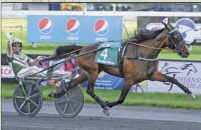
The trotter Manchego is one of the many female racehorses retired after last season's racing campaign. Manchego retired as a winner of 39 of 65 of her races, with purse earnings of $3,144,777. She was born in Kentucky and is now back living in Kentucky as a broodmare.