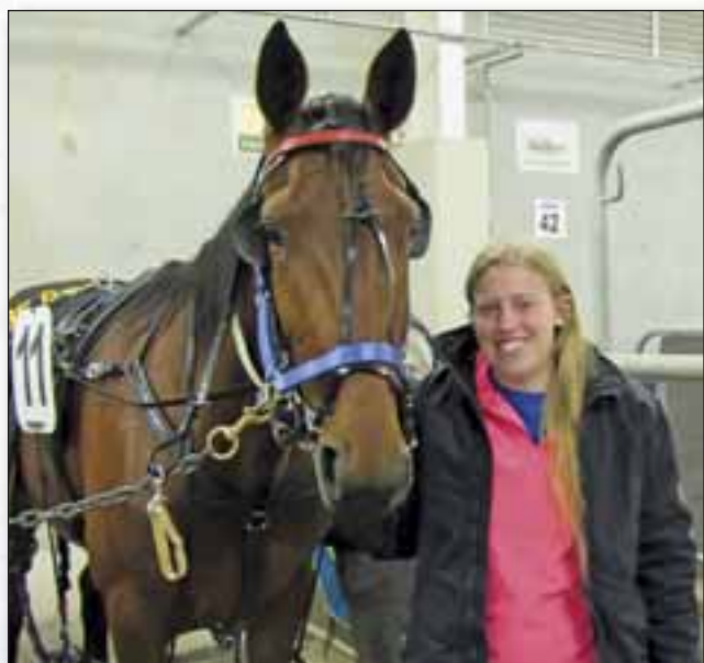
At New Zealand’s Addington Raceway with a friend’s horse, “Buzz”

involved with foaling again this year, it seemed a little slow, but now it’s fine with me,” she said.