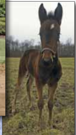
Baby Pure Country in Pennsylvania