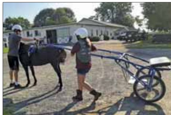
Hitched and ready to go!

Horses are lifelong companions, a great way to learn responsibility, and a "Girl's Best Friend."